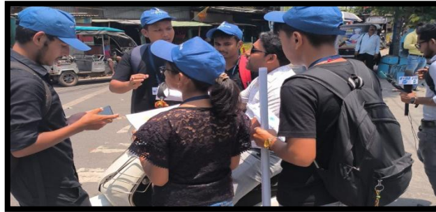
Road safety awareness programme performed by students