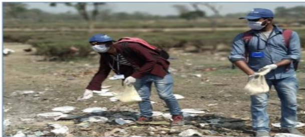
Cleanliness drive in and outside the college campus