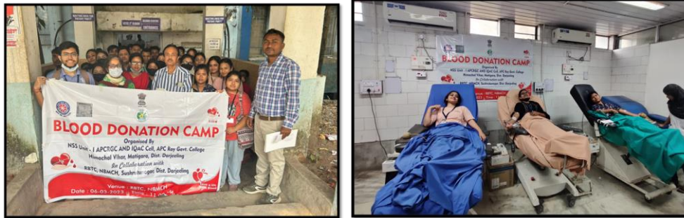
Blood Donation Camp at NBMCH on 6 th March, 2023