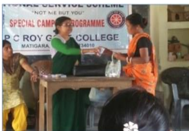
Sensitization programme at Ghoklajote village