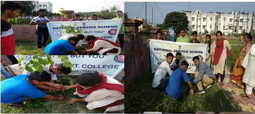
Tree plantation at Baroghoria primary school

OUTCOME: NSS volunteers and teachers reached out to many students and teachers of Baroghoria primary school on the concept of tree plantation and highlighting the significance of green environment and benefit of planting trees and developing a deeper understanding on protection and preserving the environment.