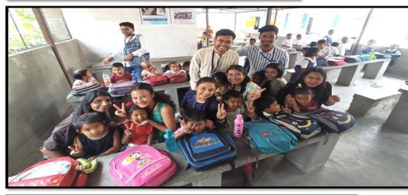
Distribution of educational kits to Baroghoria primary school

OUTCOME: NSS volunteers and teachers reached the Baroghoria primary school and interacted with the students and learnt about their hindrances and requirements, accordingly some educational kits including books, pencils and colour pencils were distributed among them which served a great purpose in meeting their educational requirements.